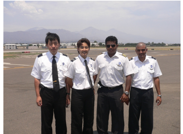
Our student pilots at the training airport.